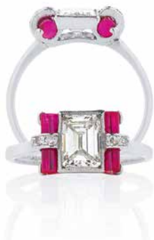
An Art Deco platinum ring featuring a 1.00ct Emerald cut diamond and synthetic tubular rubies.

info@rutherford.com.au www.rutherford.com.au