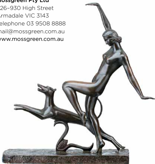
An Art Deco Bronze Figure of a Woman and Dog Signed Carnelli, Italian/French, Circa 1925.

Mossgreen Pty Ltd 926-930 High Street Armadale VIC 3143 Telephone 03 9508 8888 mail@mossgreen.com.au www.mossgreen.com.au