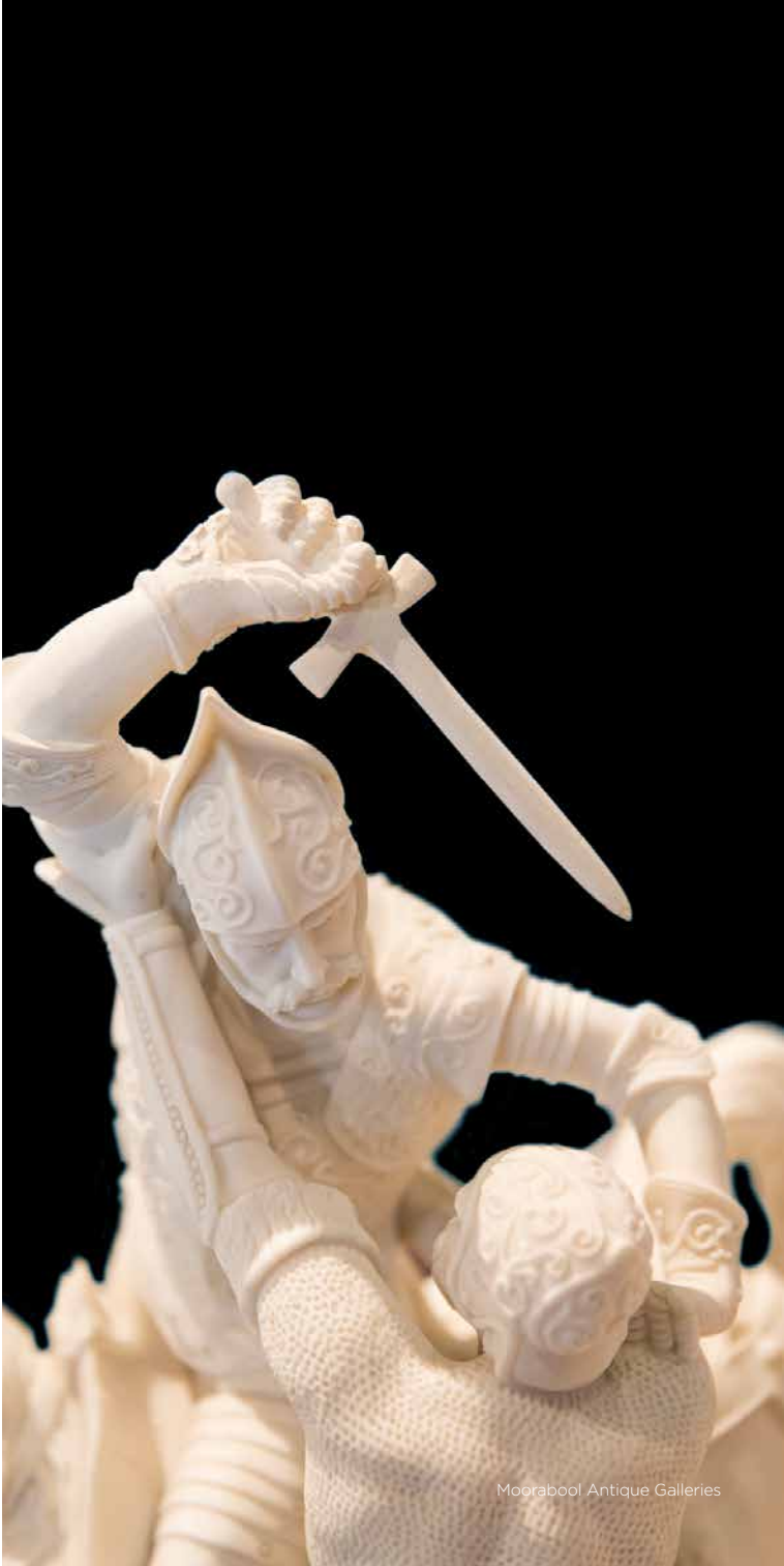
Moorabool Antique Galleries